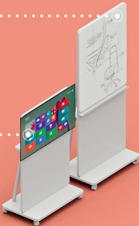
Lavagna (small) Whiteboard (small)