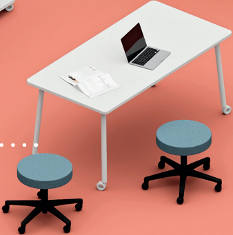
Tavolo 140 x 80 x h. 73,6 Table 140 x 80 x h. 73,6