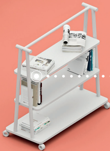
Scaffale h. 118 Bookshelf h.118