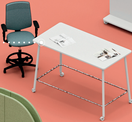
Tavolo 160 x 80 x h. 105 Table 160 x 80 x h. 105