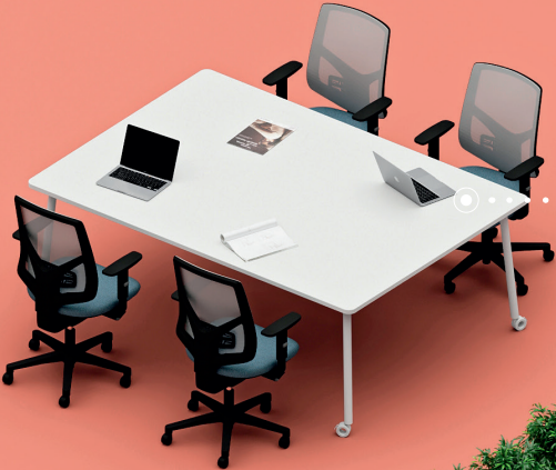
Tavolo 200 x 145,2 x h. 73,6 Table 200 x 145,2 x h. 73,6