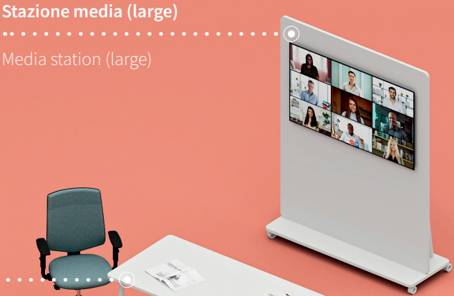
Stazione media (large) Media station (large)