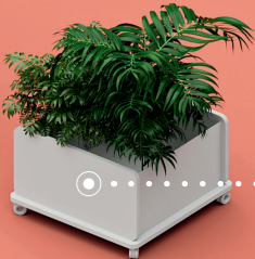
Fioriera (quadrata) Planter box (square)