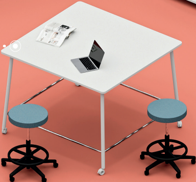
Tavolo 140 x 145,2 x h. 105 Table 140 x 145,2 x h. 105