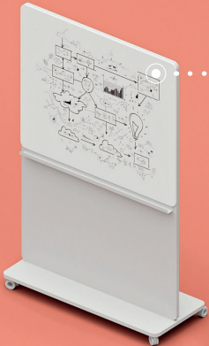
Lavagna (large) Whiteboard (large)