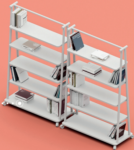
Scaffale h. 190 Bookshelf h.190